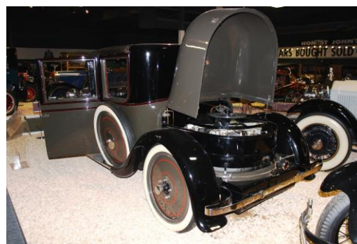
The fuel tank is under the hood, filling via the cap.