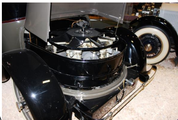
The cooling fan pushes air over two banks of finned cylinders.