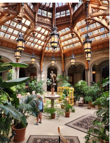
The octagonal sunken Winter Garden