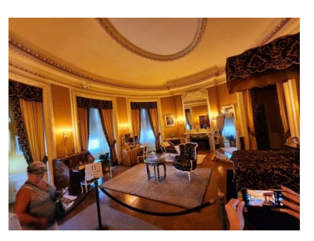
Edith Vanderbilt's bedroom