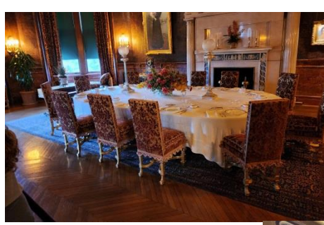
The breakfast room