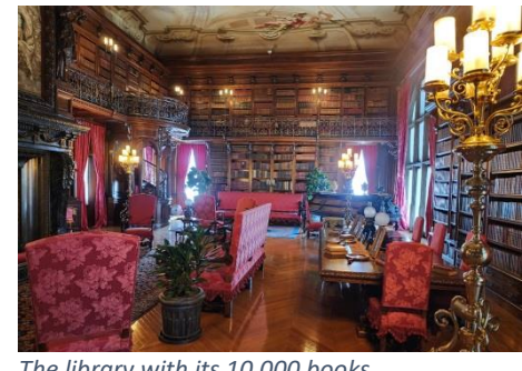
The library with its 10,000 books