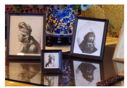
Original Rembrandt etchings