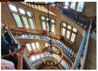
The three story grand staircase with the 72 foot chandelier