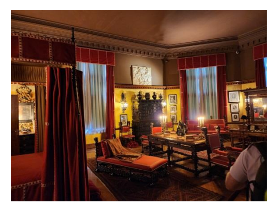
George Vanderbilt's bedroom

The estate today covers approximately 8,000 acres and is split in half by the French Broad River. The estate is overseen by The Biltmore Company, a trust set up by the family. The company is a large enterprise that is one of the largest employers in the Asheville area. Restaurants were opened in 1979 and 1987, and four gift shops in 1993. The former dairy barn was converted into the Biltmore Winery in 1985. The 210-room luxury hotel, named The Inn on Biltmore Estate, opened in 2001. In 2010, the estate opened Antler Hill Village, consisting of gift shops and restaurants, as well as a remodeled winery, and connected farmyard. In 2015, the Village Hotel on Biltmore Estate, a more casual option to The Inn with 209 rooms, was opened in Antler Hill Village.