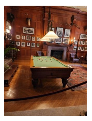
The billiard room