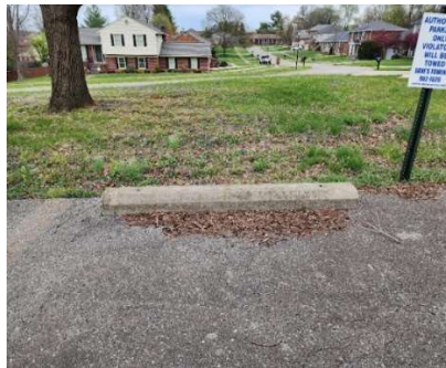
Clean up the parking lot