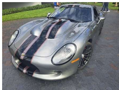
The new series 2 Cobra for 2024 that that is hand built. There are only 19 made at the starting price of $65,000.