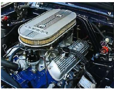
Picture of the car's engine.