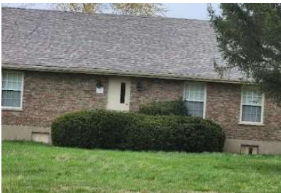
Remove more of the old overgrown bushes

Please bring any of the following tools: shovels; rakes; spades; hedge trimmers; chain saws; string trimmer; electric edger; backpack blower; safety glasses and gloves. The whole job should take about 4-6 hours.