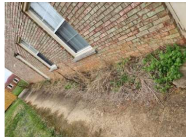
Clean up the beds on the north side of the building