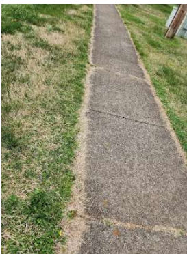
Edge the sidewalks