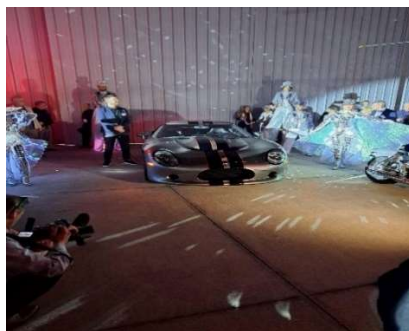
The new continuation Cobra.