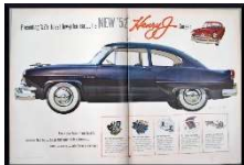
1952 Henry J