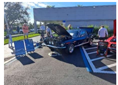
Hunt and Pat's car on display at the REVS museum.