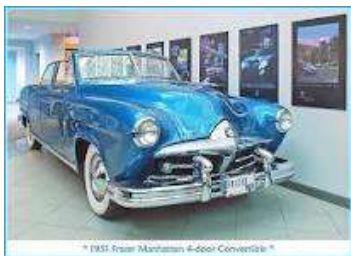
1951 Frazer Manhattan

Some car production then continued in Argentina and Brazil. Cordova and Willys were the names for two of these passenger cars. They were originally built on earlier Kaiser / Frazer mechanical designs, but they too terminated production in the 1960s.