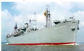
Liberty Ship-USS John W. Brown

Kaiser and Frazer cars, of course, were later also jointly produced by them. Kaiser companies were a stimulus during WWII to the industrialization of the US western coast. Kaiser Industries also included Kaiser Aluminum, Kaiser Steel, mining, cement production, radio stations, a charitable organization, and Kaiser Permanente health insurance.