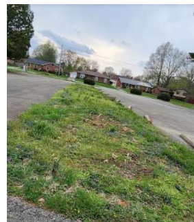
Finish filling in the areas where the bushes were removed last year