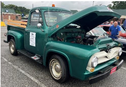
Shawn McDonald's 1955 Ford F-100