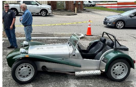
Bruce Domeck's Caterham Super 7