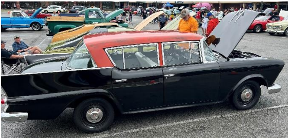
Ned Steinke's 1958 Rambler (Top 50)