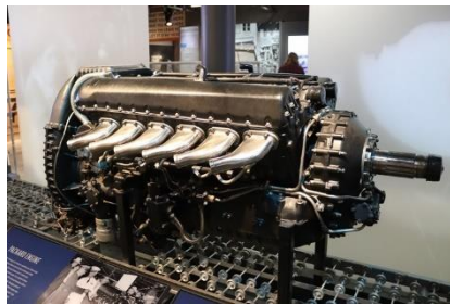
Packard Merlin aircraft engine