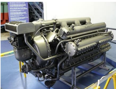
Packard maritime ship engine

Despite a great reputation, Packard was not robust in sales rivalry after WWII with other automobile companies. For example, Kaiser-Frazer had a technological head start over them immediately at the war's end, and competition was especially intense with the Detroit Big Three US automakers. Even following a 1954 merger with Studebaker, their last car was made in 1958. The Packard automotive brand name was discontinued by 1959.