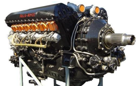
Rolls-Royce Merlin airplane engine version.