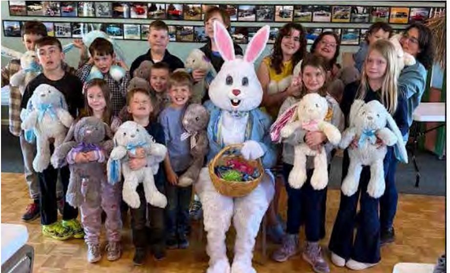
2026 Easter Egg Party participants