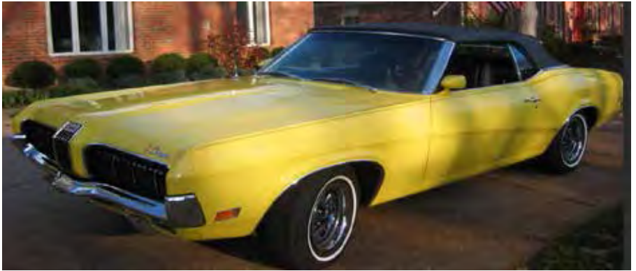
1970 Mercury Cougar XR7 Convertible - $40,000