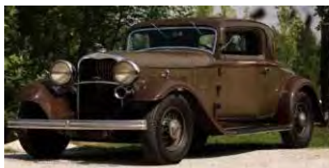
1932 Lincoln KA V8

1932 - Ford built their own Ford flathead V8