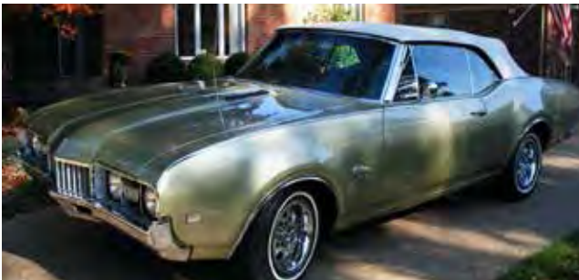
1968 Oldsmobile Cutlass Convertible - $49,000