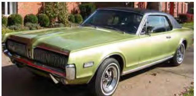
1968 Mercury Cougar XR7 4 speed coupe $44,000