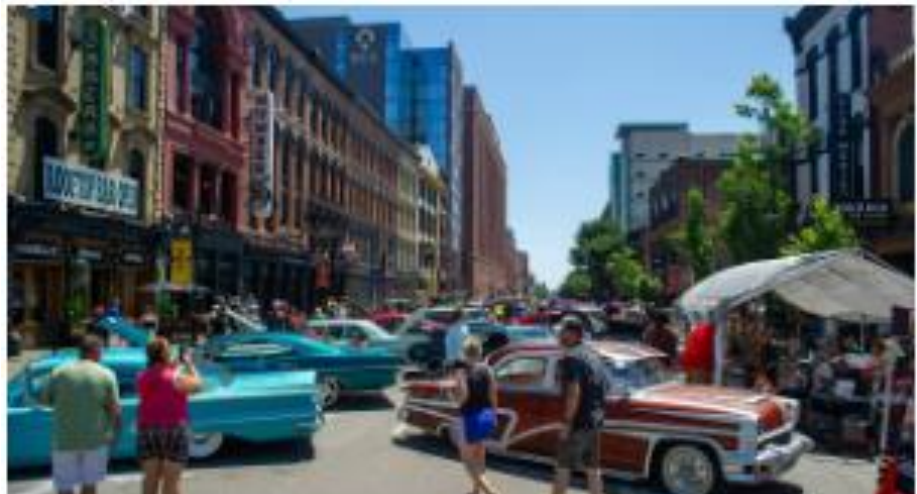
Street view down Main Street of Whiskey Row Car Show 2024