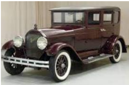
1928 Steam Car

Innovations included four-wheel brakes in 1924, and there were some minor styling changes. Further marketing concerns in 1925/1926 prompted building a less expensive version called the Junior Eight. These cars were gradually becoming less Locomobile-identified and more Durant-branded. An overhead valve, 8-cylinder power plant became available in 1927, along with various other engine options, like some from Continental and/or Lycoming.