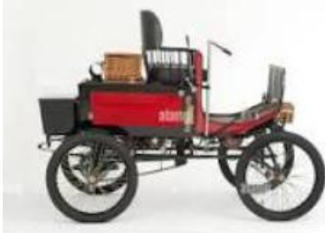
1901 Steam Car

The Locomobile steam car story begins in 1899 at the Locomobile Company of America in Watertown, MA. Here they produced small, affordable, and relatively popular steamers. Legend has it that the name comes from combining the words "locomotive" with "automobile", thus Locomobile.