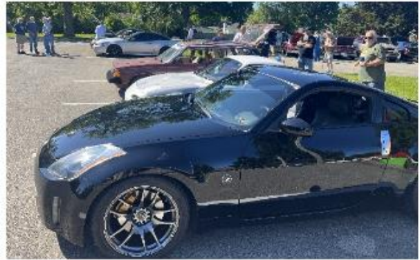
May Cars & Coffee at KYANA