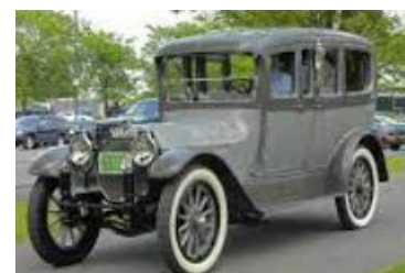
1914 Steam Car

Locomobile added electric starters and interior lighting in 1913. From then on, engineering focused on the precision manufacture of luxury cars, undergoing relatively little alteration. They were still making right-hand drive cars for export until 1915, after which only domestic left-hand drive cars were offered.