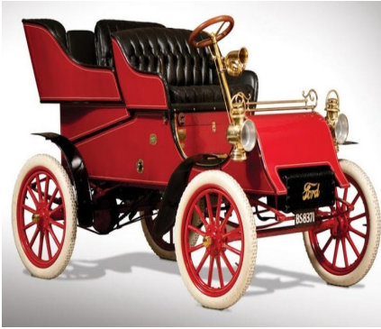
1903 Ford Model A Four-seater Tonneau

Most were painted black, but offered also in gray, green, and/or blue, etc. Model D or Es seem never to have existed.