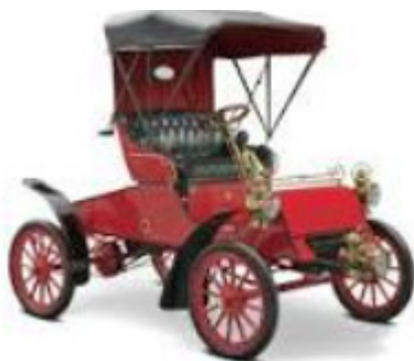
1903 Ford Model A Runabout

This Model A was a short-lived, yet successful and lucrative car, despite overheating and transmission slippage. Nevertheless, Henry Ford advertised it as, "the most