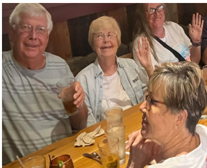
Some of the KYANA gang out to dinner at Grand Nationals in Dayton, OH>