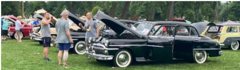
DeSotos on the show field in Akron, OH at their national convention.