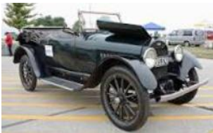
1917 Chevy Model D

However, the 1917-1919 Chevrolet - Model D - already had a large, powerful, and almost forgotten V8. Both engines are famous in their own way; previously, they had been using an excellent four-cylinder engine. This dramatically new 1917 Chevy Model D was to replace the Chevrolet 490. Beyond boasting about this fine, lesser-known, new, and big engine, the D was a much larger, heavier, more costly vehicle. Chevrolet and Ford were, and remain, vigorous market share competitors; the Chevrolet Model D, with a V8 engine, was to give