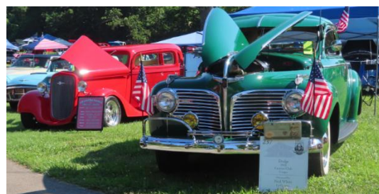
Neil White's 41 Dodge