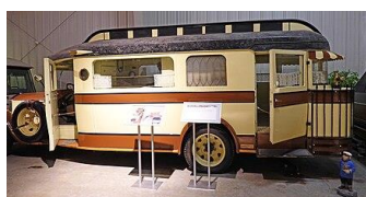
F1919 Pierce-Arrow Housecar