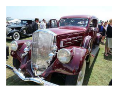
1935 Pierce-Arrow Silver Arrow