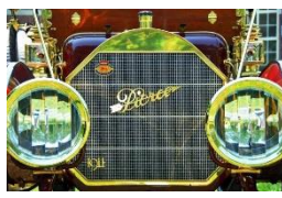
1911 Front View