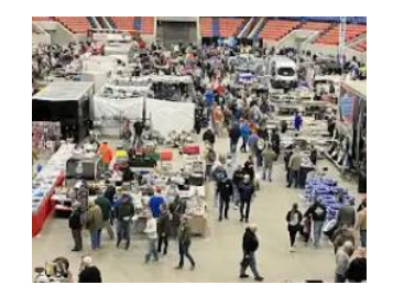
Snapshots of the 2025 KYANA Swap Meet