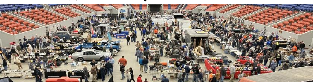
view of the vendors in Broadbent Arena at the 2025 KYANA Swap Meet