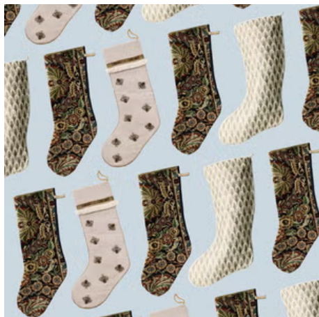
25 Best Christmas Stockings for a Cozy Mantel