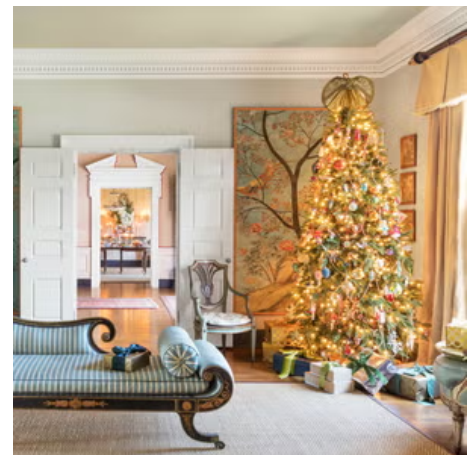
44 Chic Christmas Tree Ideas From Top Tastemakers