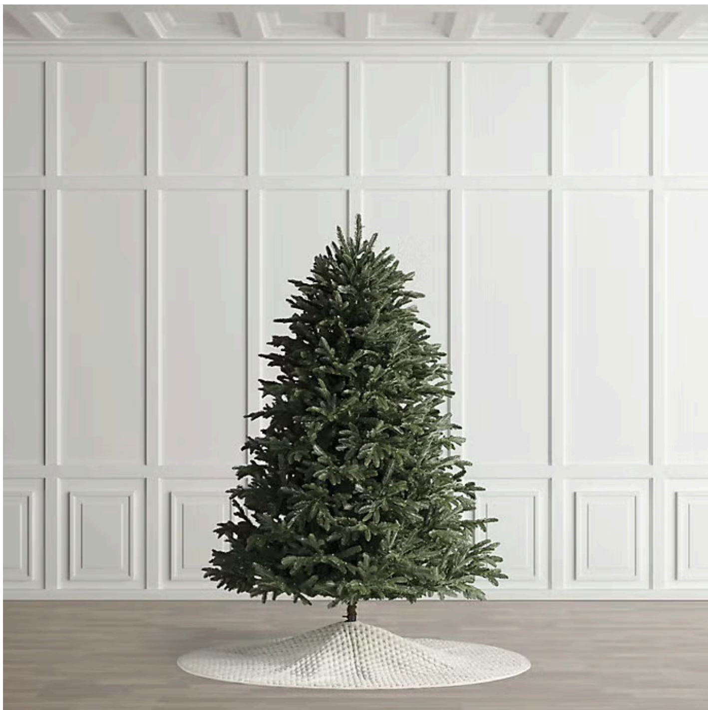
Windsor Noble Fir Full Profile Quick-Light Tree