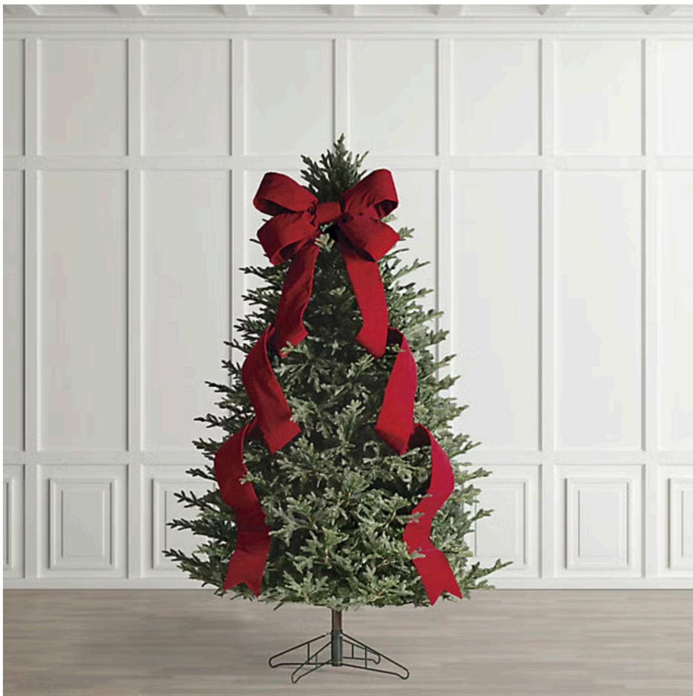
Indoor 10 ft. Velvet Bow