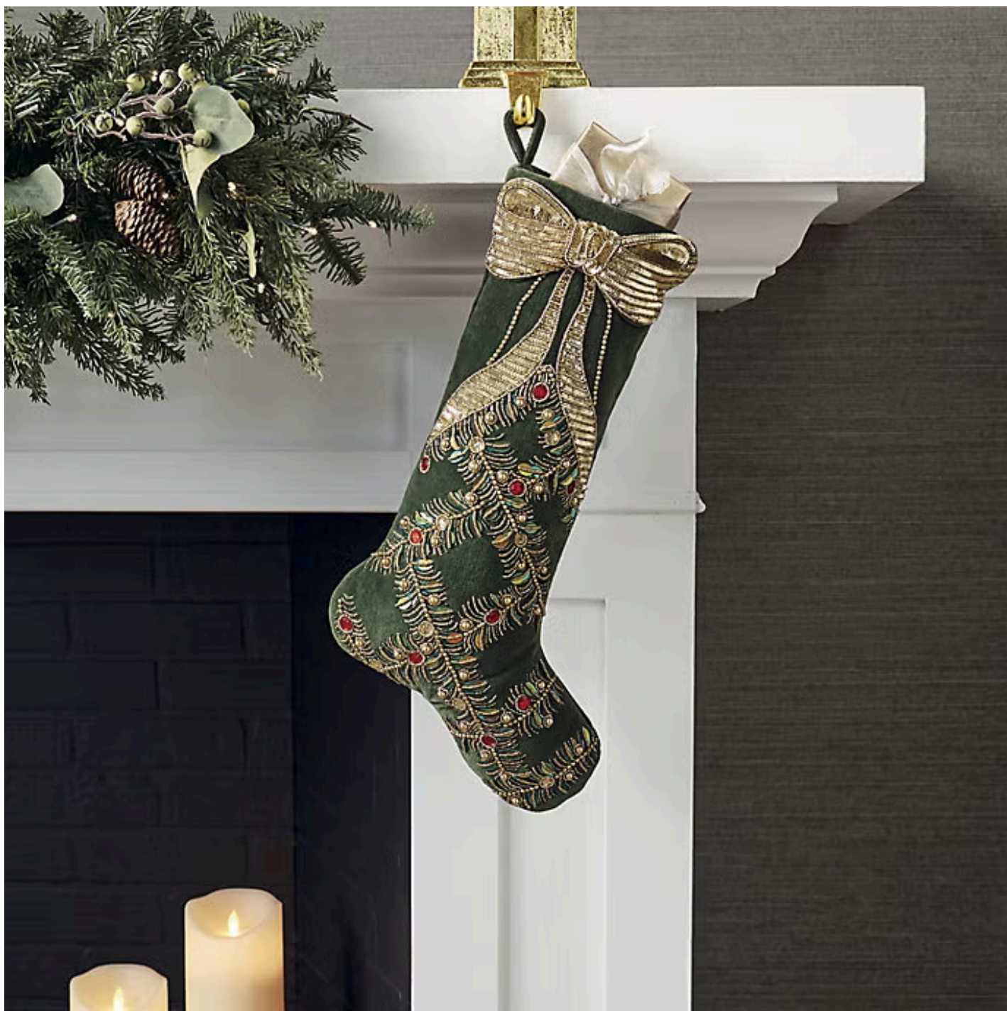
Wrapped in a Bow Stocking