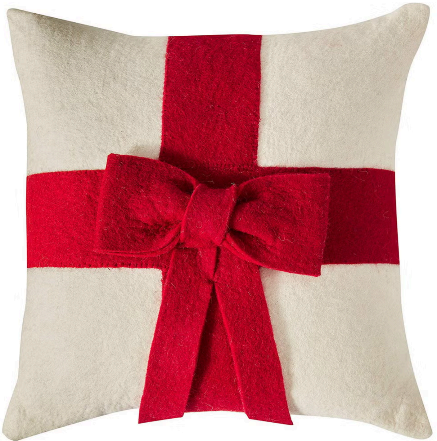
Arcadia Home Christmas Pillow Cover, 20"