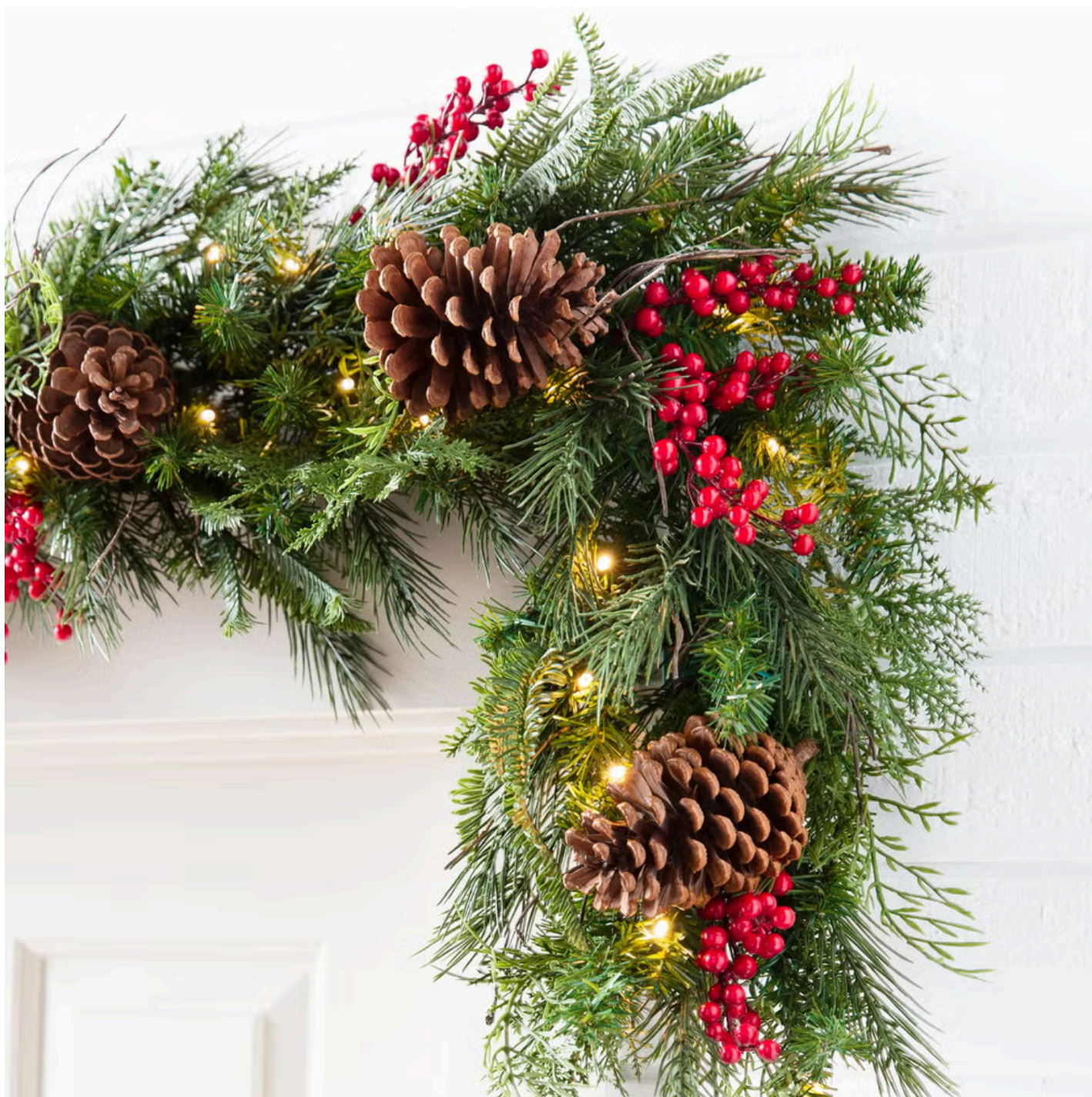
Outdoor Red Berry Pine Foliage