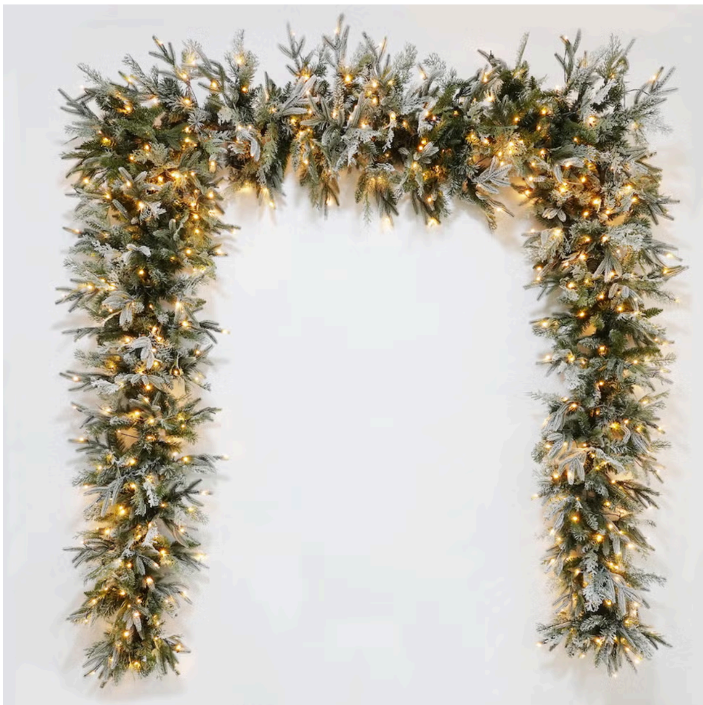
Lighted Flocked Door Garland - 20 Feet