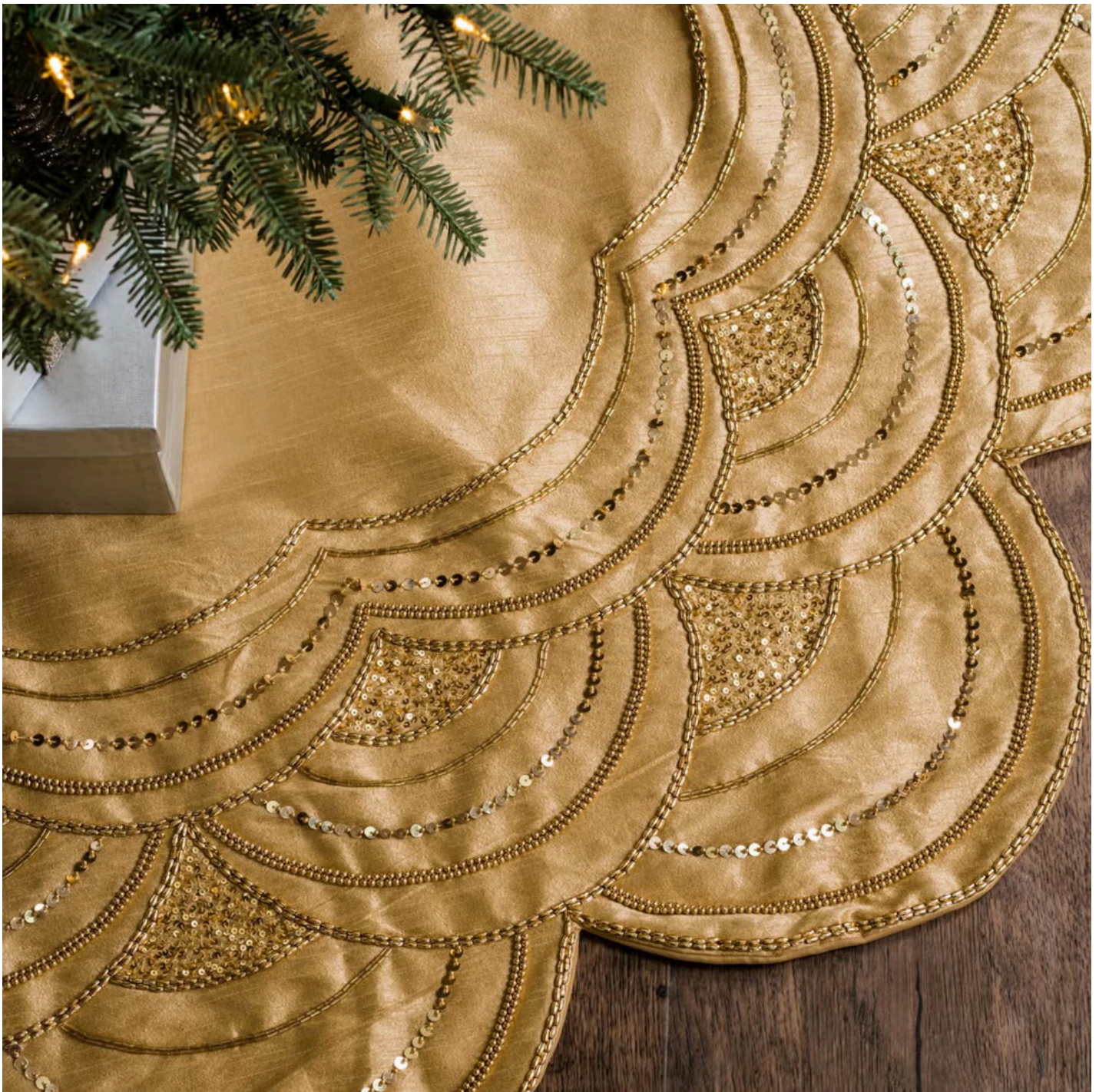
Elizabeth Beaded Christmas Tree Skirt