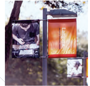
Above Langara College and its wealth of programs are within walking distance from Cambie Gardens.

Considered Vancouver’s most upscale shopping destination, Oakridge is the city’s focal point for all things fashionable. For everyday essentials explore the shops at Marine Gateway. This transit hub is bustling with amenities, and access to the rest of the city.