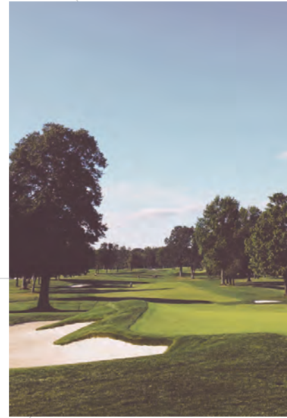
Above Contoured fairways at Langara Golf Course