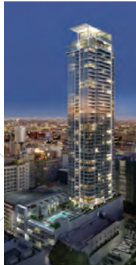
Right 825 South Hill, Los Angeles