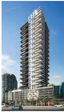
Left 1335 Howe, Vancouver