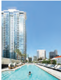
Left LEVEL, Furnished Living, Los Angeles