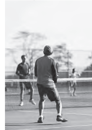
Right Tennis courts along the Langara Trail