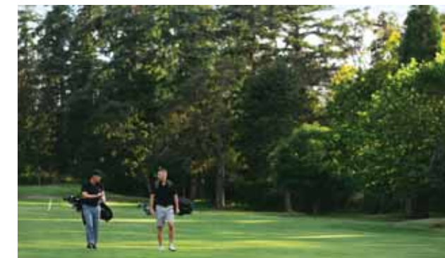
Guildford Golf & Country Club · 5 Min Drive