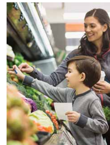
Real Canadian Superstore · 3 Min Walk