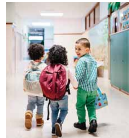
Frank Hurt Secondary · 6 Min Walk