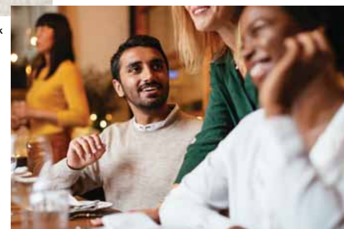
Boston Pizza · 5 Min Walk