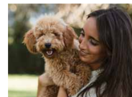
Community Park · 1 Min Walk