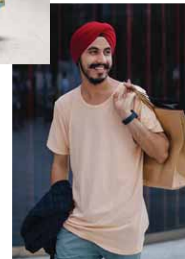
Dollarama · 4 Min Walk