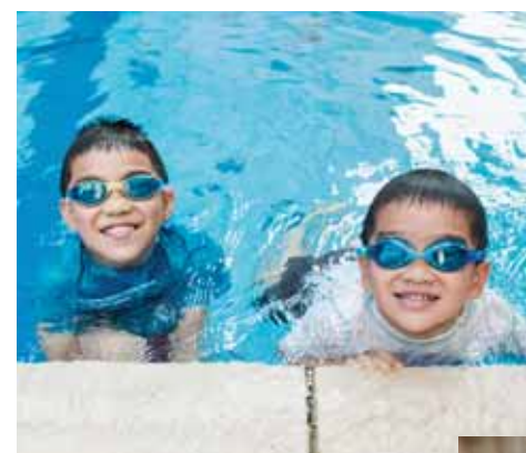
Newton Recreation Centre · 8 Min Walk