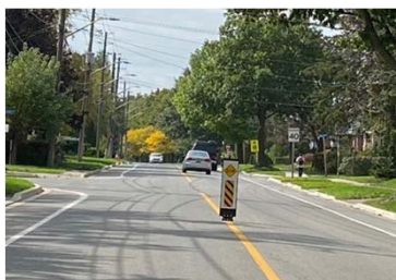
Pavement Markings & Traffic Calming Bollard