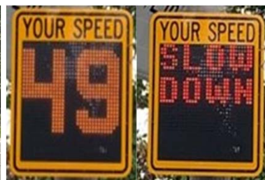
Speed Awareness Devices