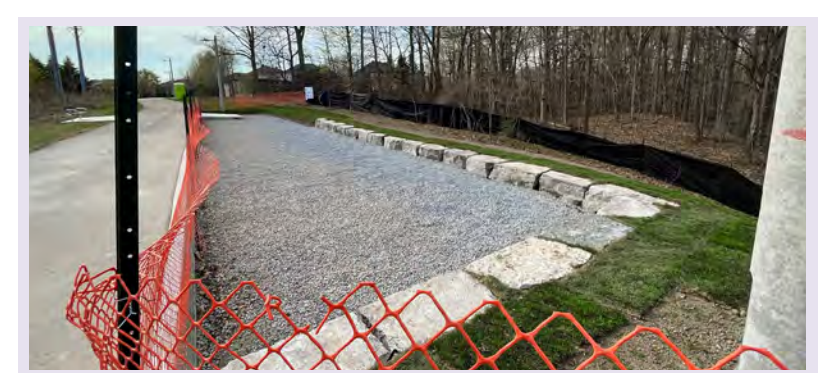
Second Line West Fitness Trail