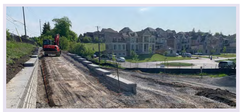
Pedestrian Trail Connection Derry Road West to Culham Trail