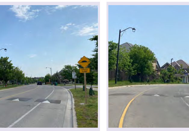
Novo Star Drive