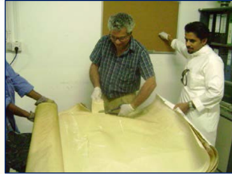
On-site membrane autopsy

Over 37 years of technical expertise and hands-on experience & involvement in tens of membrane plants & projects worldwide, especially in Saudi Arabia, United Arab Emirates, Bahrain, Kuwait, Oman, Malta & USA.