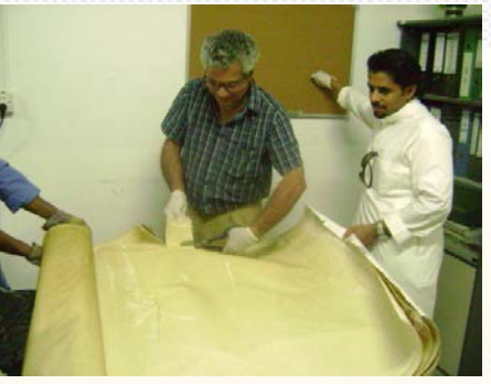
On-site membrane autopsy

Supervision of UF membrane installation as part of engineering project management of a newlyconstructed UF-SWRO IWP Plant