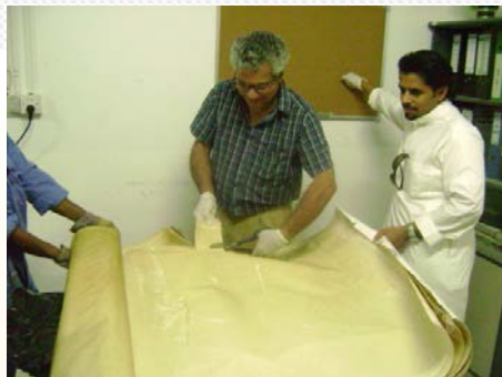
On-site membrane autopsy