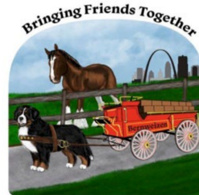
BMDCA National Specialty 2024