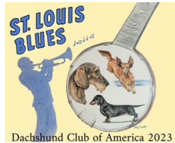
Dachshund Club of America 2023