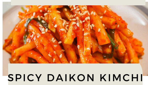
SPICY DAIKON KIMCHI