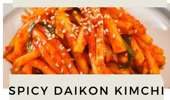
SPICY DAIKON KIMCHI