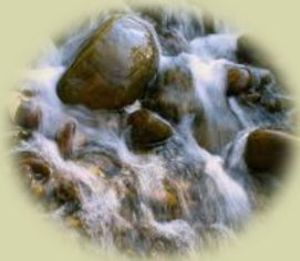
Brighter Future with New Beginnings

In 2008 Mindful Innovations Counseling Services, PLLC was established as a private practice to provide outpatient treatment to individuals and families in search for Behavioral/ Mental Health and Substance Abuse Services. Mindful Innovations Counseling Services, PLLC (MICS) is dedicated to servicing Bexar County and its surrounding population. MICS consists of Licensed Professionals who are proficient in their area of specialty. Our goal is to improve your daily struggles by targeting the challenging tasks in your life. Through mindful thinking and innovative work, our Licensed Professionals can guide you to a brighter tomorrow.