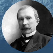
John D Rockefeller Founder of the Standard Oil Company

If you want to succeed you should strike out on new paths, rather than travel the worn paths of accepted success.