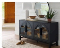
TV CONSOLE TABLE