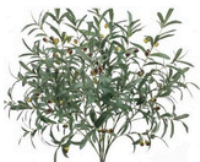
OLIVE BRANCHES-MANTLE DECOR