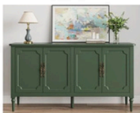
TV CONSOLE TABLE