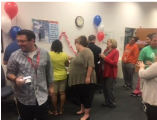
Employees attend the opening ceremonies of the Consolidation Room near Door 18 in the Flat Top.

Night/swing shift employees can also set up appointments and every effort will be made to accommodate them. Seasonal employees can also take advantage of the room during lay off status. Arrangements will be made to get them into the building.