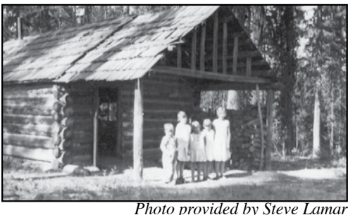
Students in front of the Smith Creek School