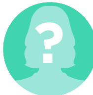
Local Speaker To be determined