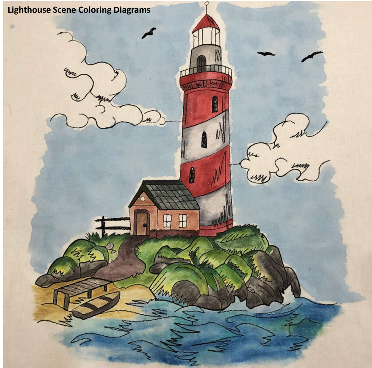
Lighthouse Scene Coloring Diagrams