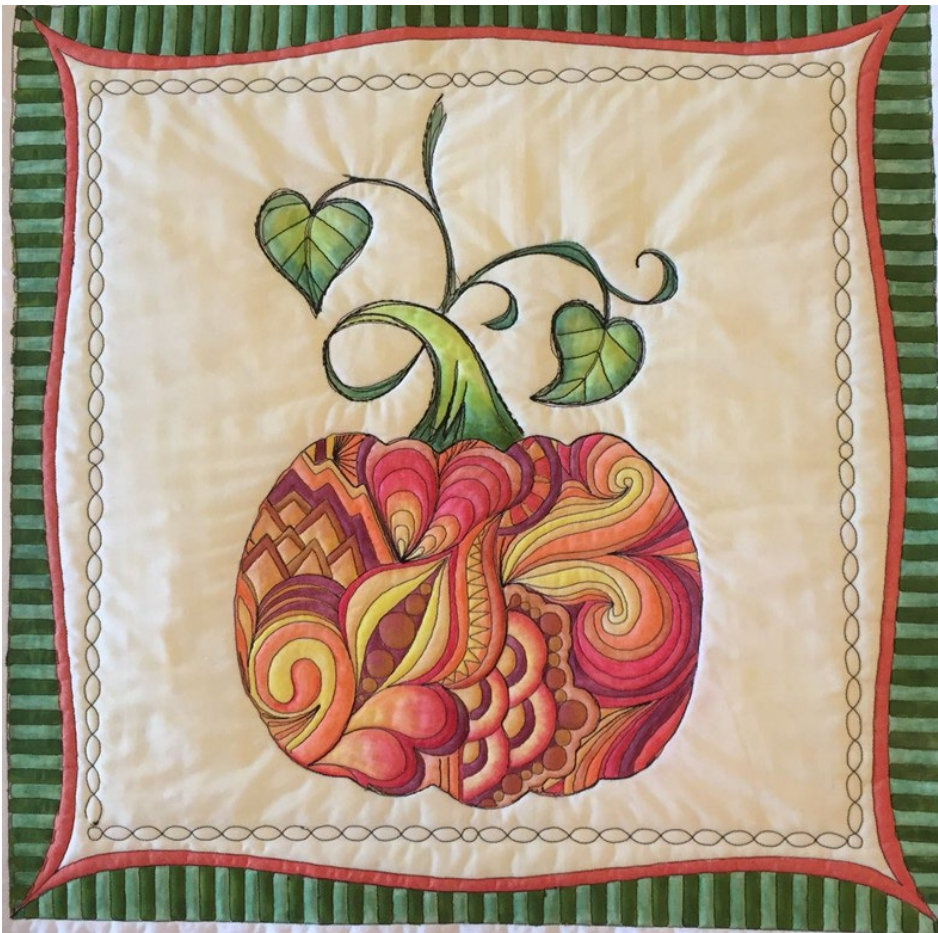
Zentangled Pumpkin with Frame

Choice of Pumpkins – $65.00 Kits use Inktense pencils, fabric markers and gel pens