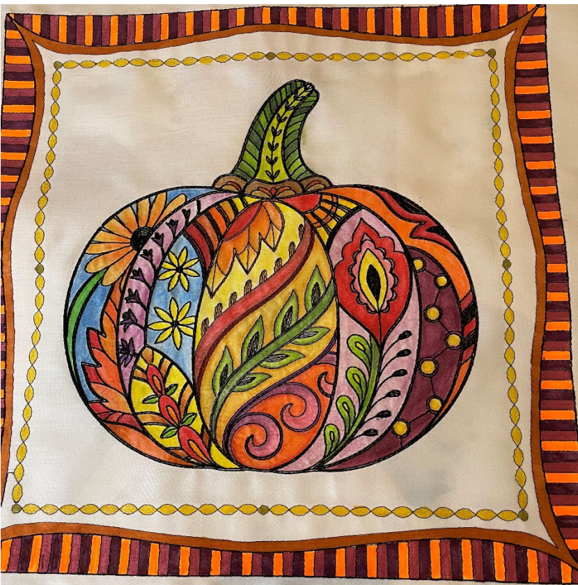
Doodled Pumpkin with Frame