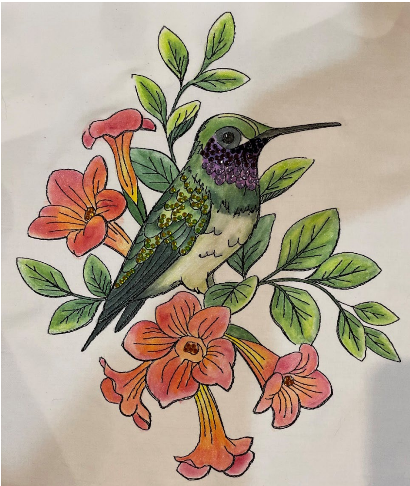
Black Chinned Hummingbird