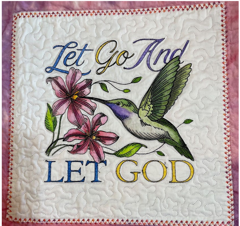
Let God Saying – $55.00