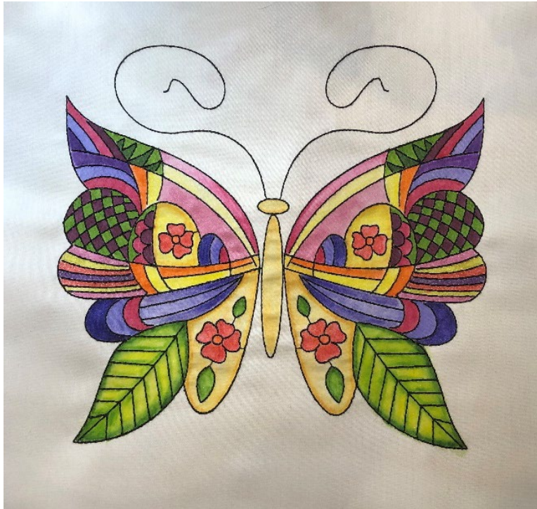
Butterfly 1: Inktense pencils and fabric markers

Butterfly Series: Each butterfly focuses on a specific technique which is listed under each picture. Class fee is $50. (Color selection is up to each student – I will have enough colors for students to color any of the butterflies in their preferred color palette.)