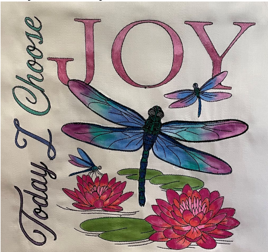
Today I choose Joy - $55.00