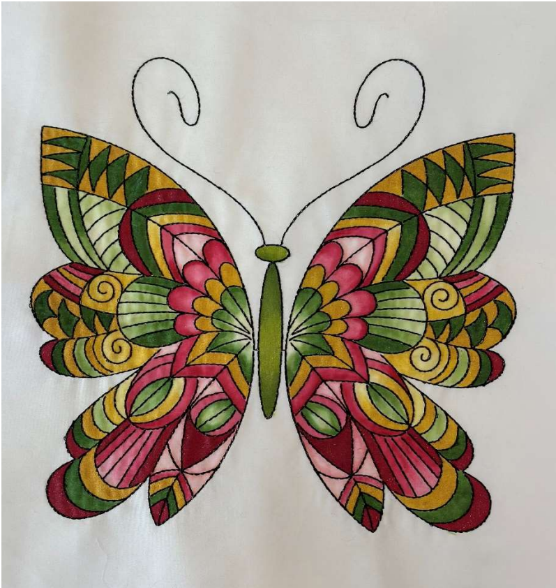
Butterfly 4: Fabric Paints