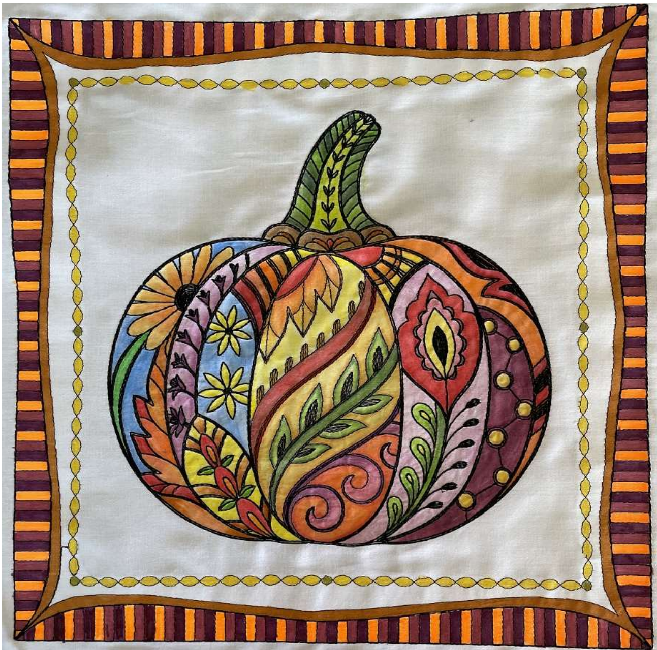
Doodled Pumpkin with Frame

Choice of Pumpkins – $65.00 Kits use Inktense pencils, fabric markers and gel pens