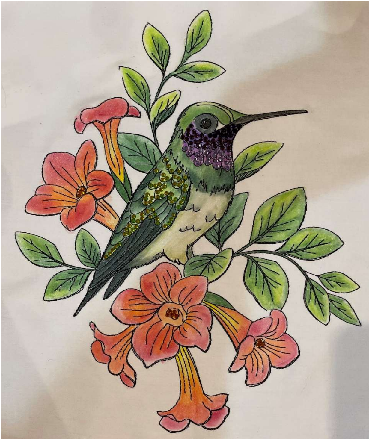
Black Chinned Hummingbird