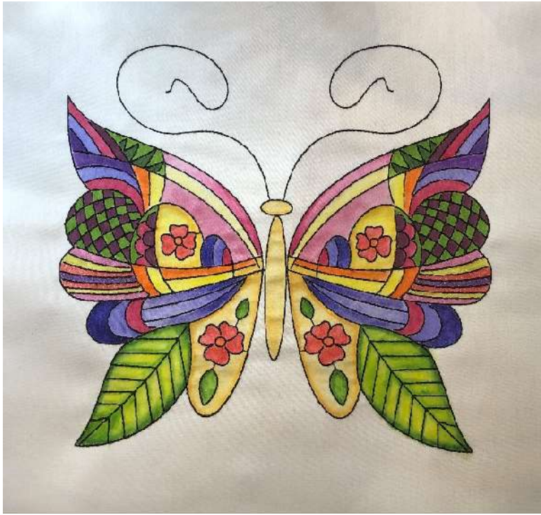
Butterfly 1: Ink and fabric markers

Butterfly Series (12 x 12 inch block each): Each butterfly focuses on a specific technique which is listed under each picture. Class fee is $50. (Color selection is up to each student – I will have enough colors for students to color any of the butterflies in their preferred color palette.)