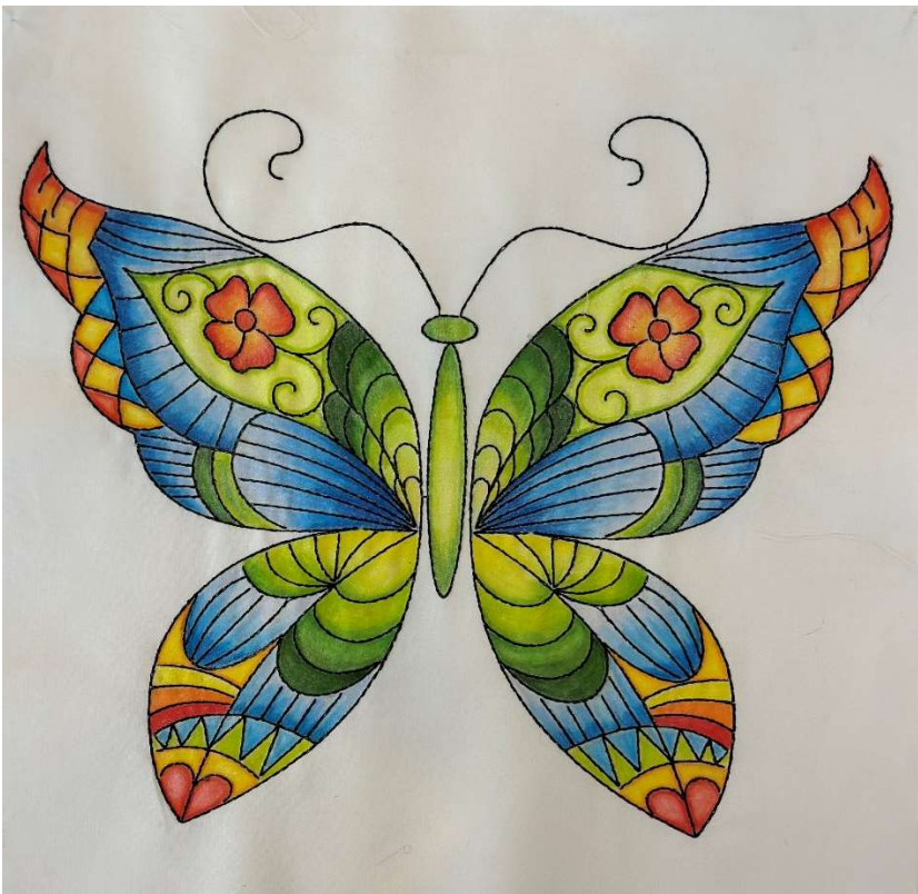
Butterfly 6: Watercolors (usually pencils but can be pans)