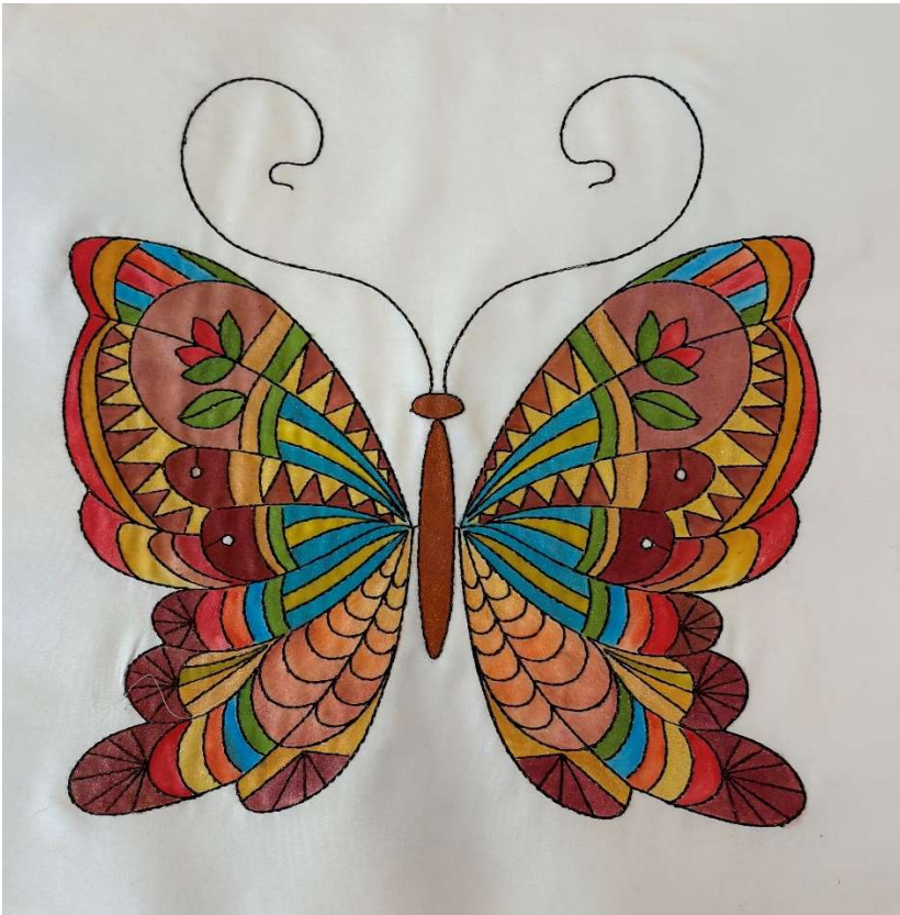
Butterfly 5: Metallic Paints