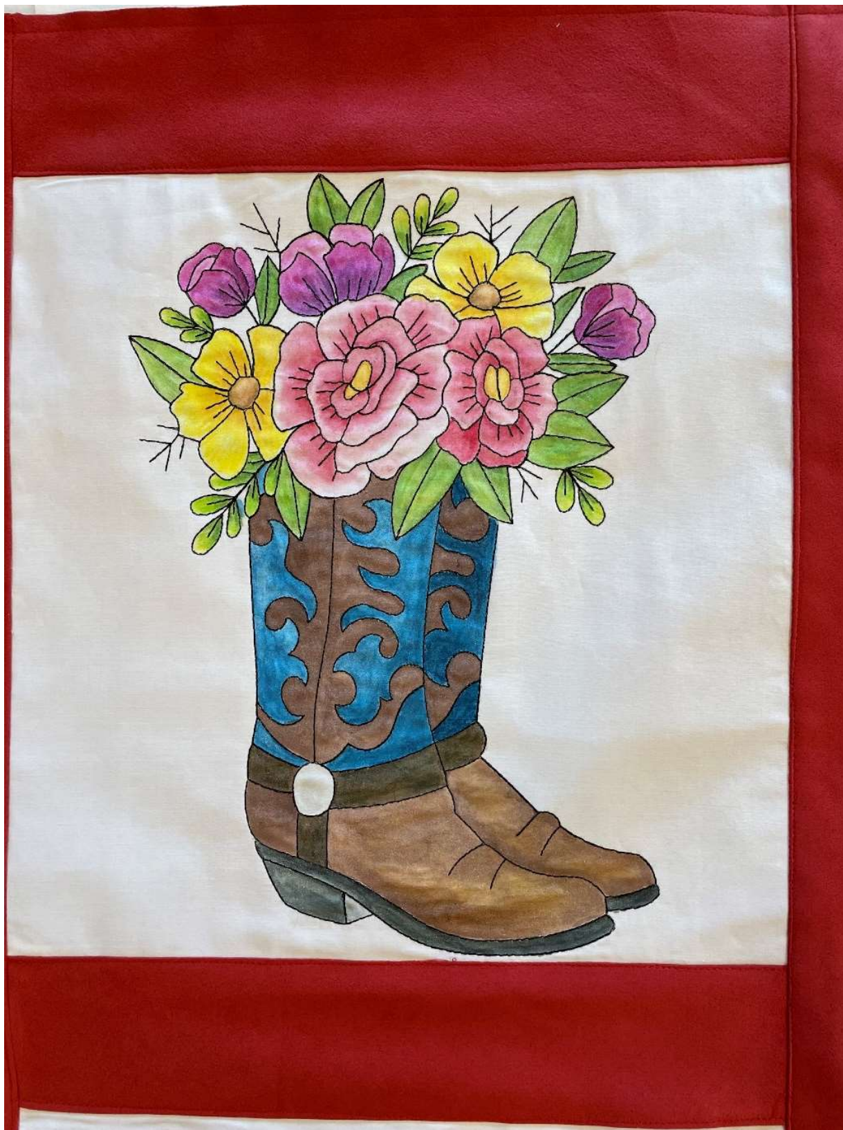
Cowboy Boots with Flowers

Boots with Flowers - $50.00 each Kits use Inktense pencils, fabric markers and fabric paint. Bling kit included.