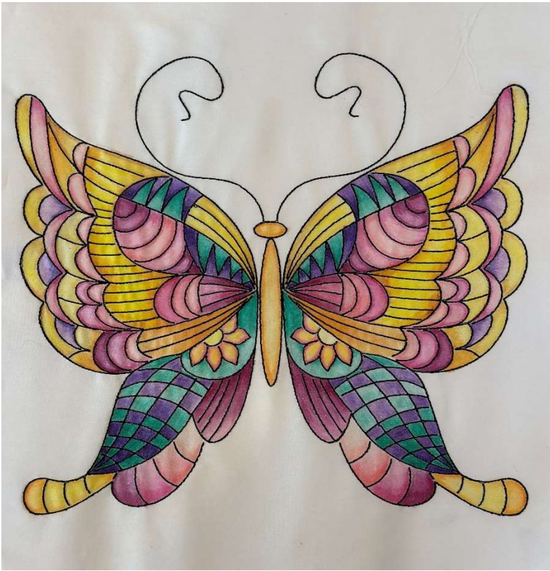
Butterfly 3: Ink or Watercolor with focus on shading