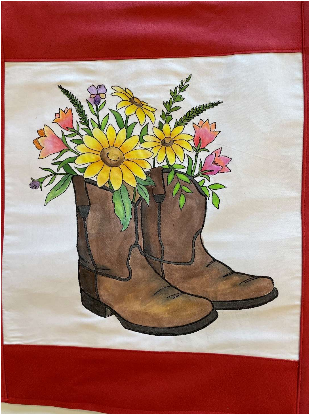
Farmers Boots with Flowers