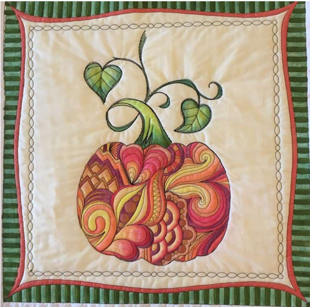
Zentangled Pumpkin with Frame