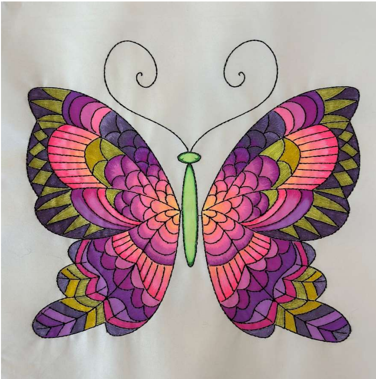
Butterfly 2: Gel Pens