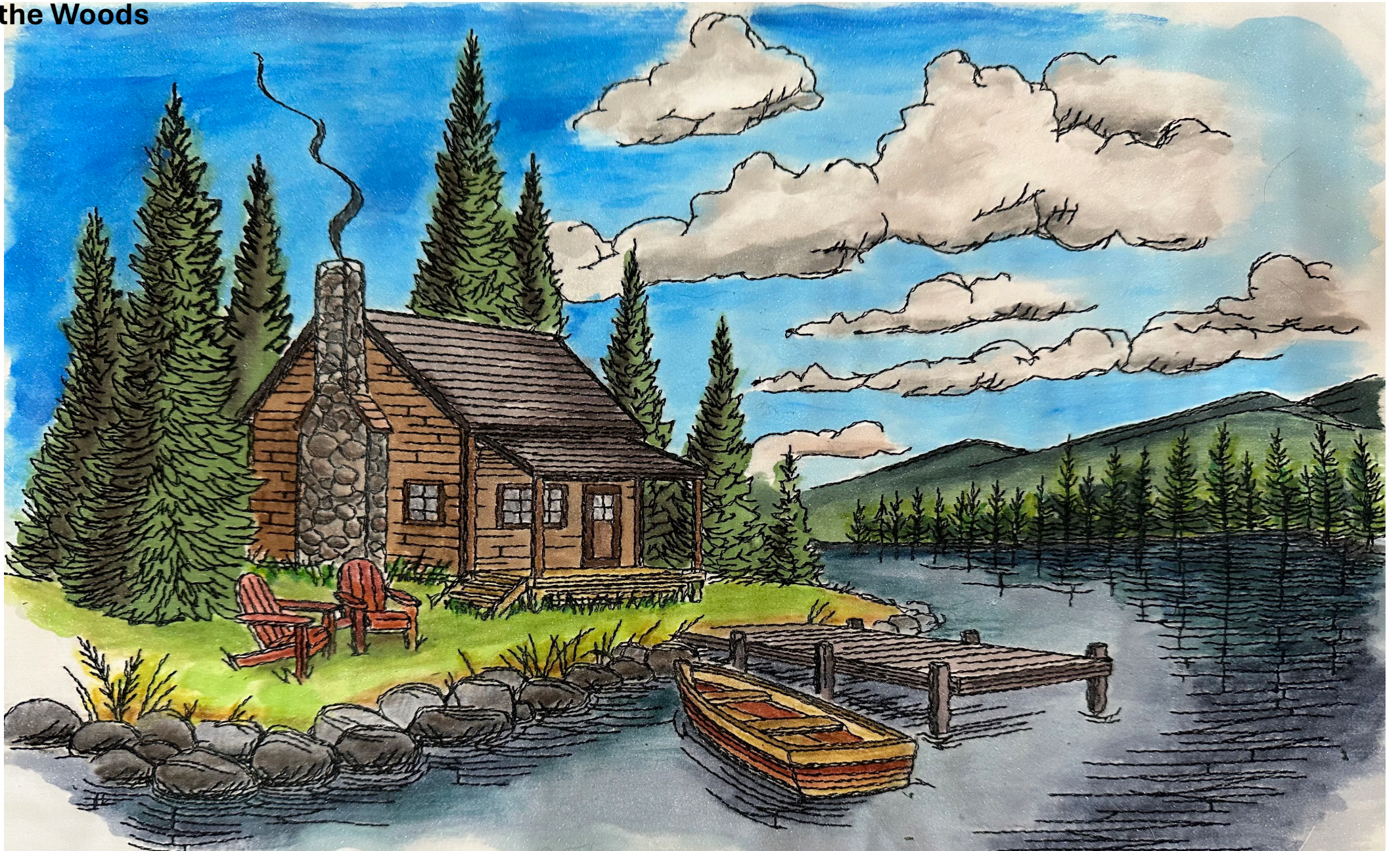
Cabin in the Woods