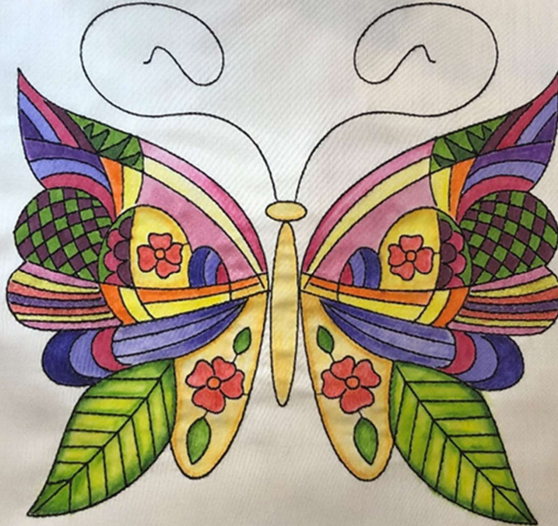
Butterfly 10 (Block KK 1477) also known as Fabric 101 Butterfly