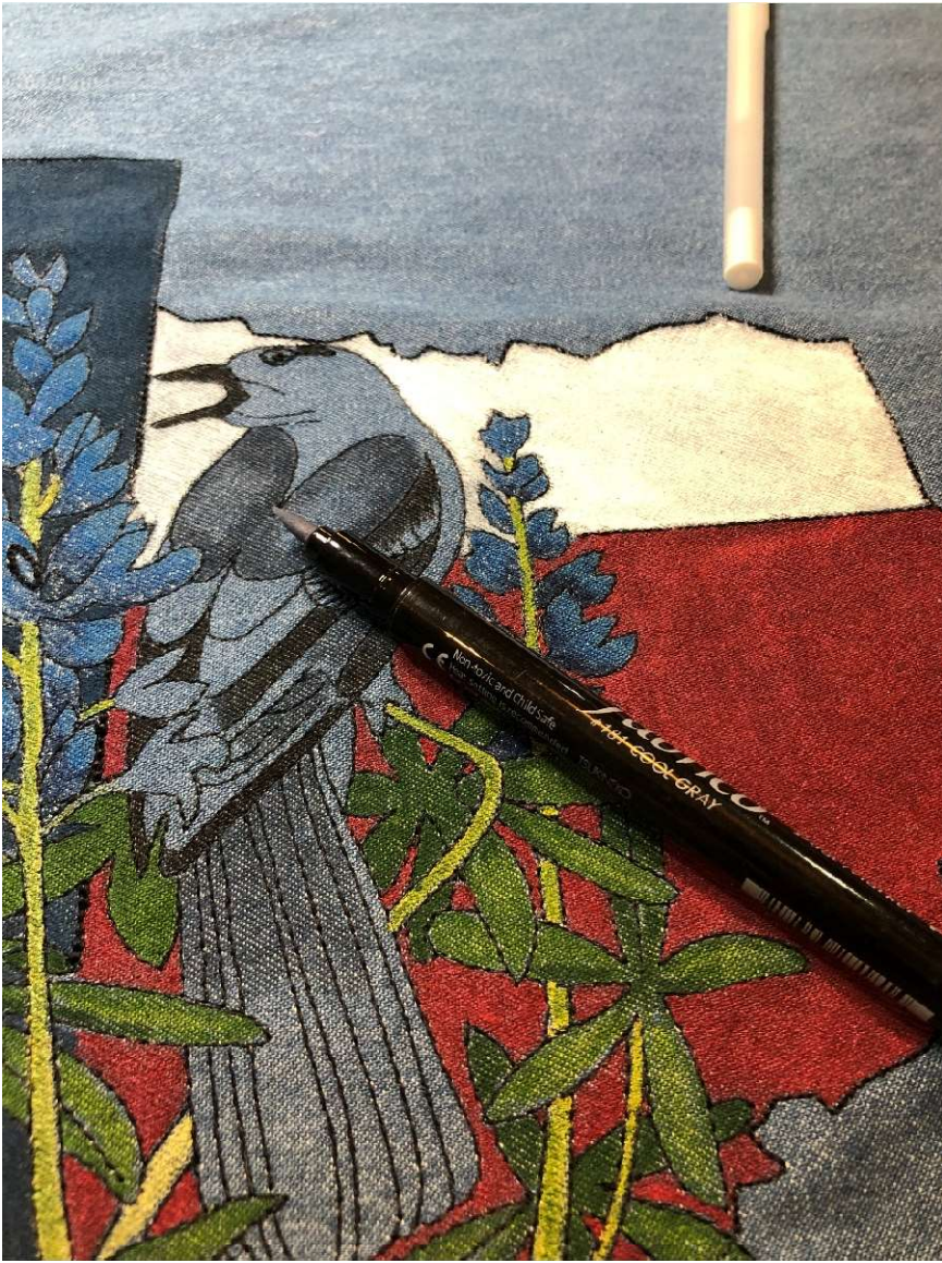
Using the Fabric Cool Grey pen, color the upper wing parts and 2/3 of the tail feathers. Use the Cool Grey to add a little grey underneath the black as seen in the photo above.