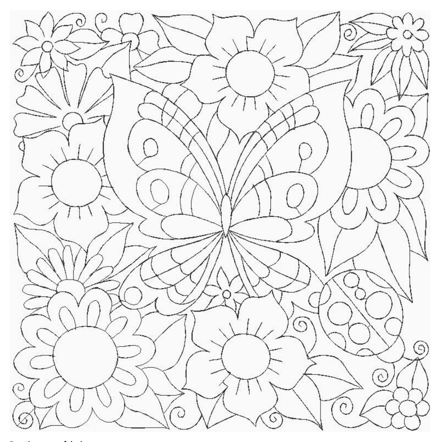
Practice copy of design