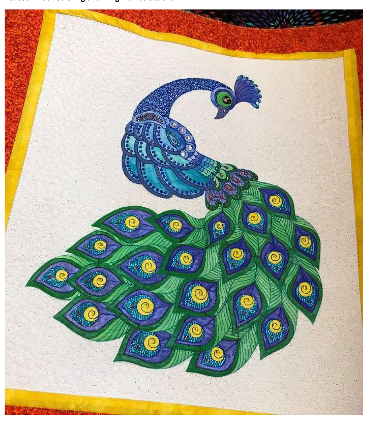
Peacock Block Coloring and Bling Kit Instructions