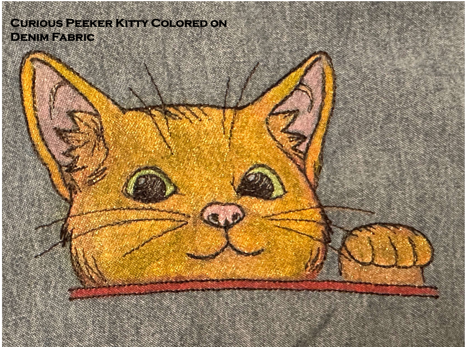
CURIOUS PEEKER KITTY COLORED ON DENIM FABRIC