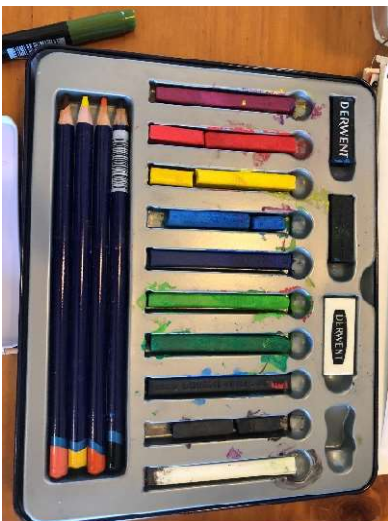
Example of some very used Inktense blocks!

One note about Inktense Ink... it also comes in blocks or sticks of pure color. Sometimes coloring a large area with a pencil is time consuming and awkward. You can use the blocks to produce a large quantity of paint by scraping part of the stick into a small paper cup that has some fabric medium in it. I find it is easier to mix in cups that have plastic lids so that I can save my paint for later use.