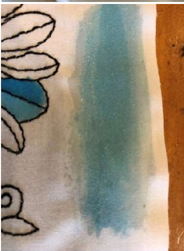
Example of scooping out color from melted watercolor cake and blending with additional fabric medium to make a lighter shade of color. The sky effect was done by putting fabric medium down on the fabric first then coloring with watercolor.

Continually stir your paints if mixed with textile medium to keep it from drying out and blended. Use a drop or two of water to thin but NO MORE THAN TWO DROPS! Too much water can cause bleeding. You may want to mix your paints in Dixie cups with lids as they can be saved for a short while using the lid. However, the paints will eventually dry so use them within a couple of days after mixing. You may also try using a couple of drops of your fabric medium to revive your color.