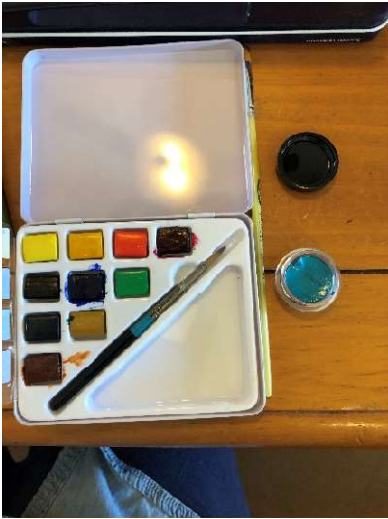
Examples of watercolor cakes

I have been asked about Shiva Paintstiks which are an oil based paint stick. They are beautiful colors and blend very easily however I prefer to use water based products that can be cleaned with soap and water. An oil based paint like Shiva Paintstiks needs to be cleaned up with mineral spirits as well as the brushes used to apply the paint.