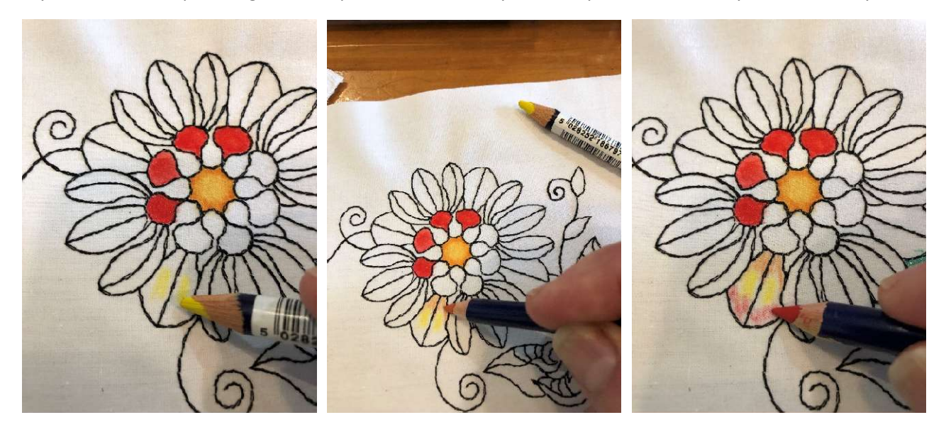
Color each part of the petal starting with the lightest color first and work towards the darkest. Notice that the coloring does not have to be perfect. Now apply fabric medium starting at the base of the petal and work up towards the red.

My favorite technique using Inktense pencils! The beauty of these pencils is that they blend so easily!