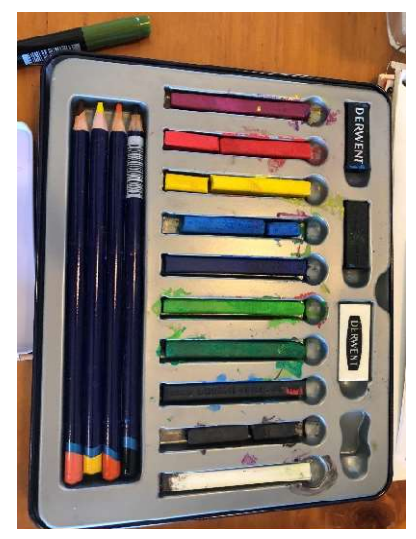
Example of some very used Inktense blocks!

One note about Inktense Ink... it also comes in blocks or sticks of pure color. Sometimes coloring a large area with a pencil is time consuming and awkward. You can use the blocks to produce a large quantity of paint by scraping part of the stick into a small paper cup that has some fabric medium in it. I find it is easier to mix in cups that have plastic lids so that I can save my paint for later use.