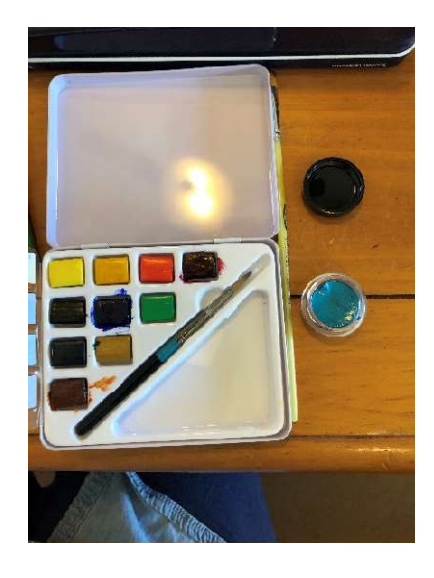
Examples of watercolor cakes

I have been asked about Shiva Paintstiks which are an oil based paint stick. They are beautiful colors and blend very easily however I prefer to use water based products that can be cleaned with soap and water. An oil based paint like Shiva Paintstiks needs to be cleaned up with mineral spirits as well as the brushes used to apply the paint.