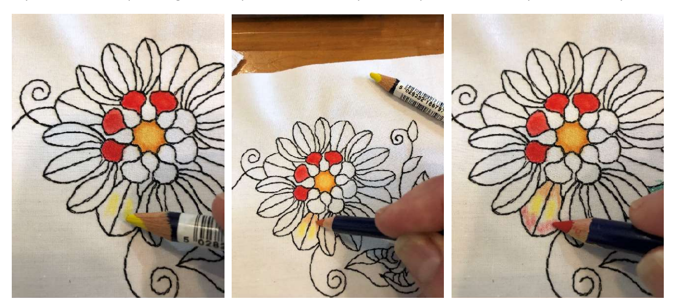
Color each part of the petal starting with the lightest color first and work towards the darkest. Notice that the coloring does not have to be perfect. Now apply fabric medium starting at the base of the petal and work up towards the red.

My favorite technique using Inktense pencils! The beauty of these pencils is that they blend so easily!