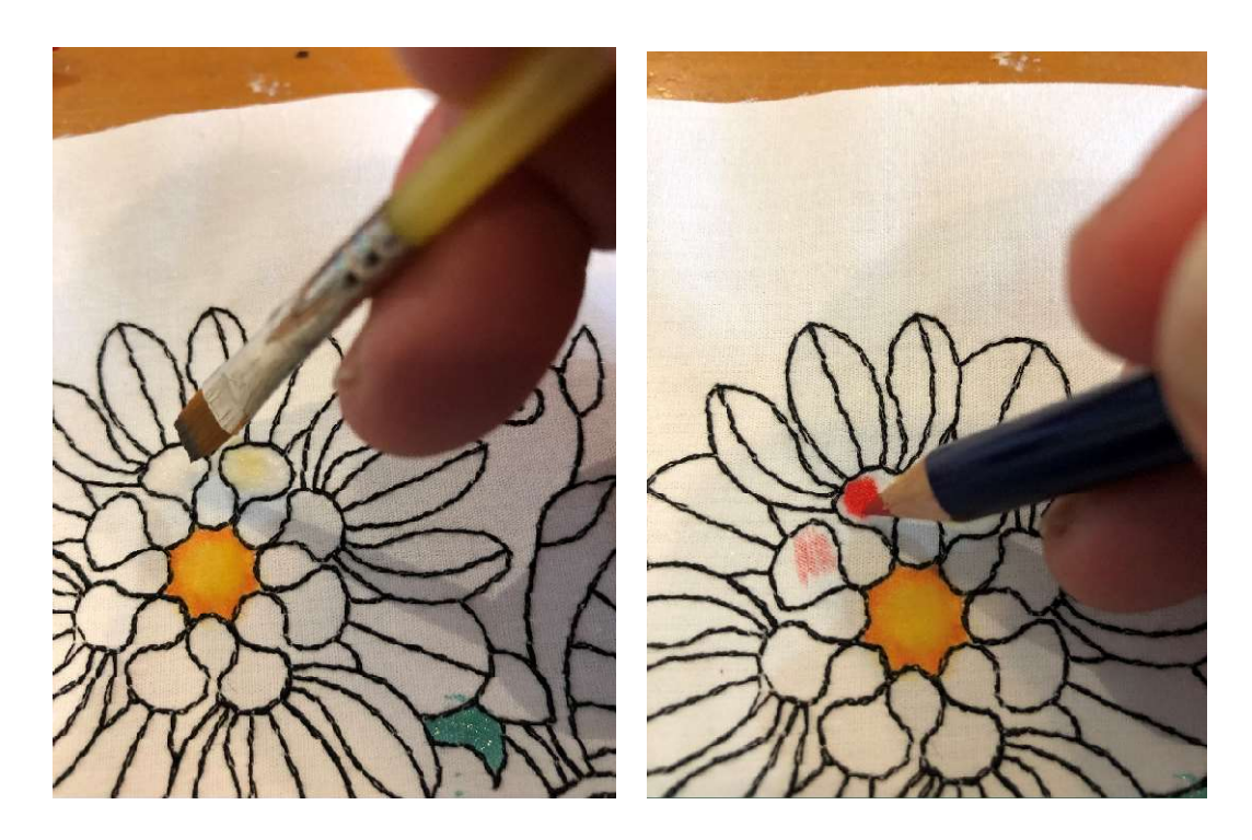
Example of wet/dry on wet. Fabric was moistened first then color applied. Notice that one of the petals looks slightly yellowish. I forgot to wash the brush before I moved on to new coloring area. DO NOT MAKE THE SAME MISTAKE! You may get strange color combos!