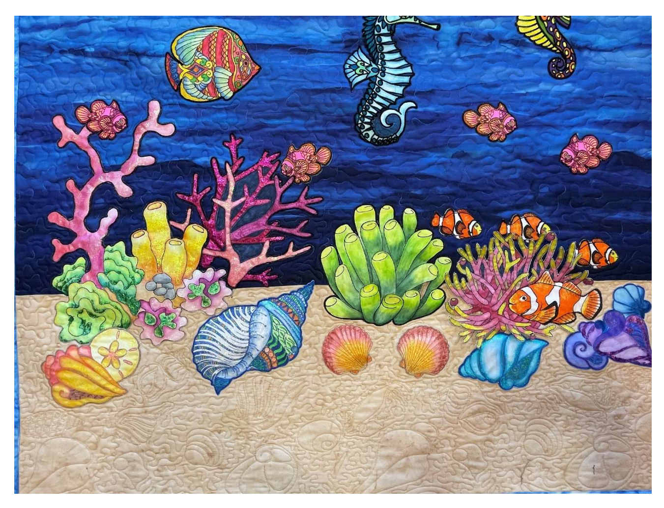
Bottom view of Zen by the Sea Wall Hanging