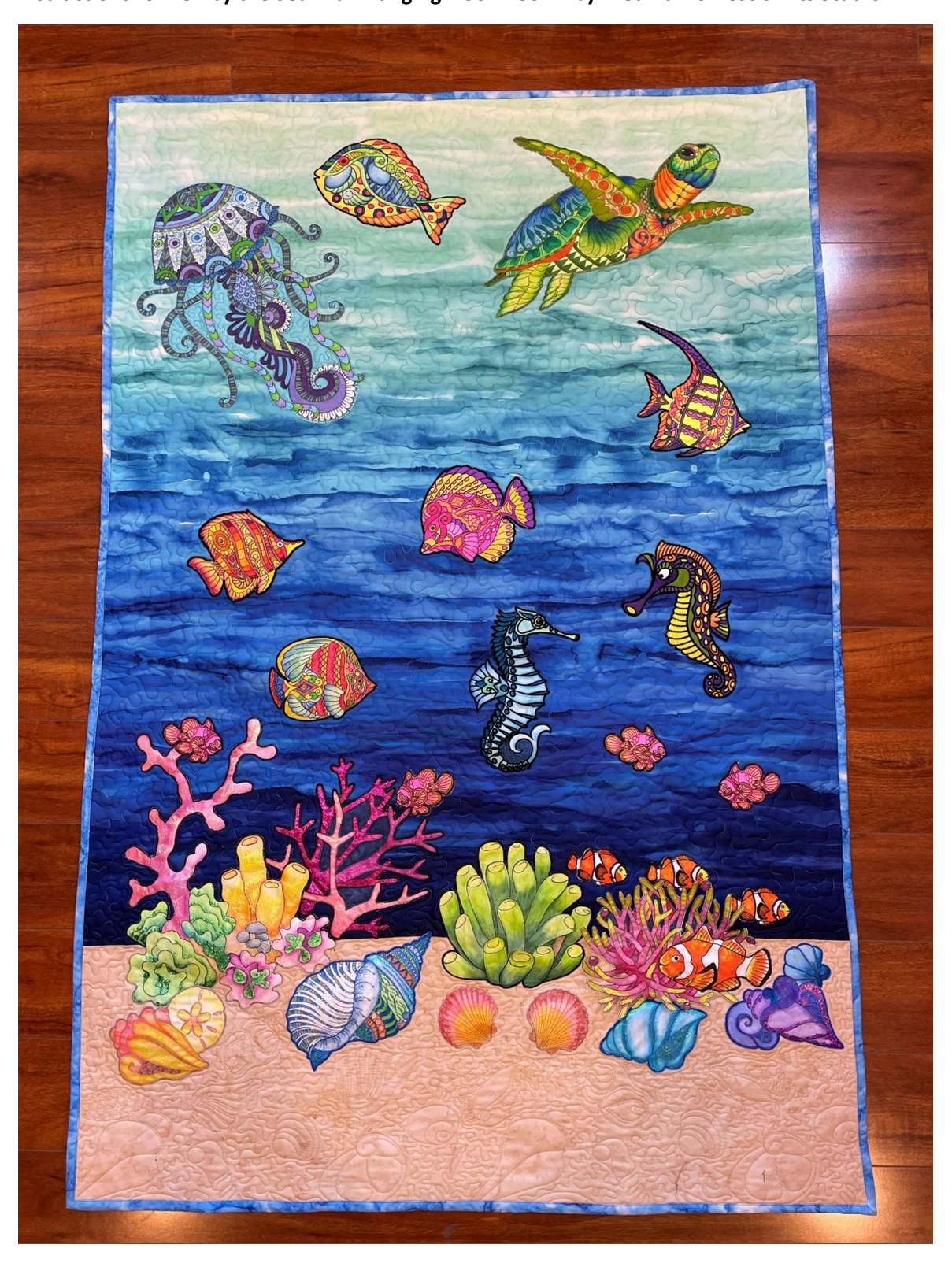
Instructions for Zen by the Sea Wall Hanging – 36" x 55" – by Medina Domestic Arts Studio

Zen by the Sea is an applique quilt where embroidered blocks are colored with a variety of coloring tools; then cut out and glued/stitched to the background fabric. The quilt is for intermediate level quilters who have experience painting on fabric. If you are a beginner please consider coloring a practice block first before attempting any of these blocks.