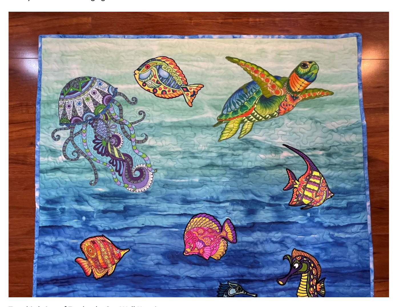
Top third view of Zen by the Sea Wall Hanging