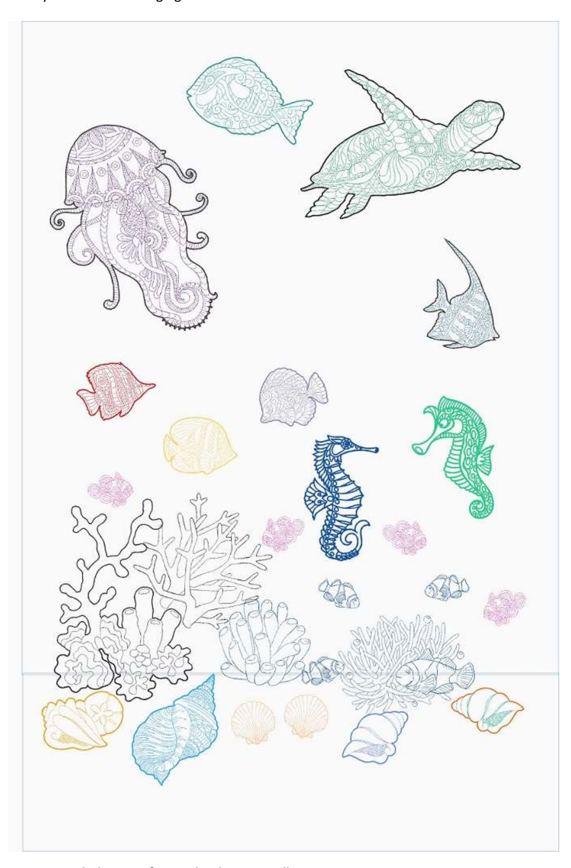
Recommended Layout for Zen by the Sea Wall Hanging.