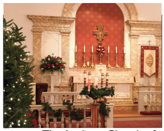
The Anglican Church of St John the Baptist