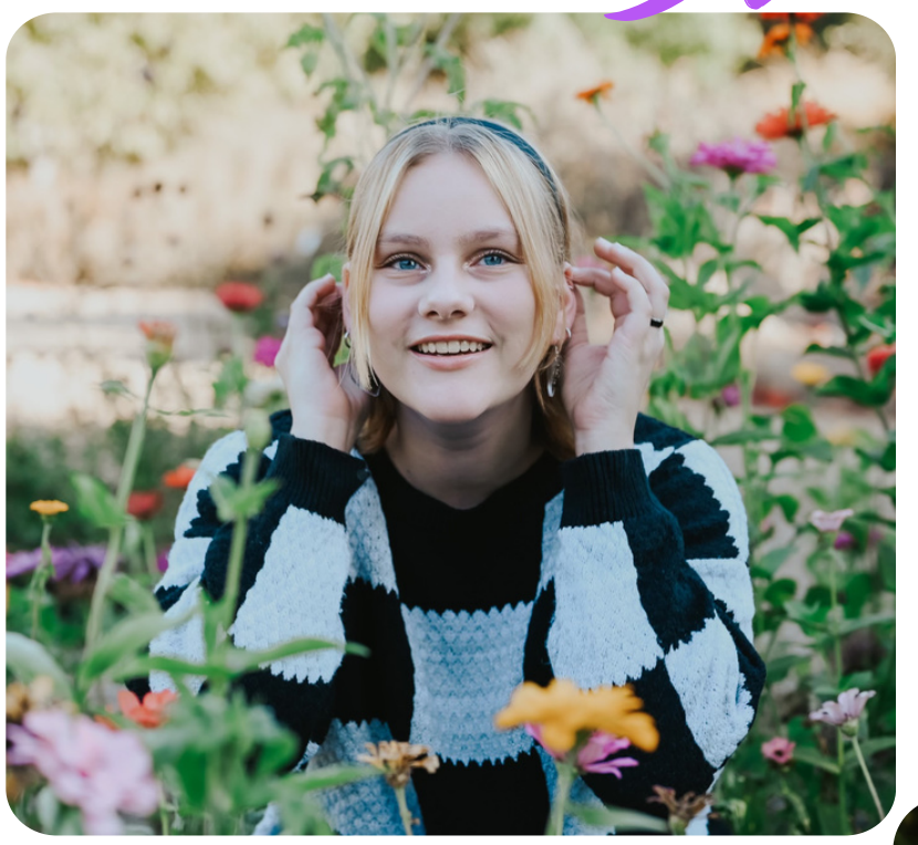
What is your favorite food? Udon and Miso Soup.

What are some of the activities, clubs, extracurriculars etc. you participated in during high school?