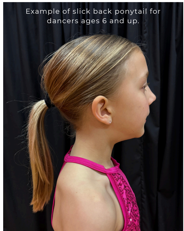
Example of slick back ponytail for dancers ages 6 and up.