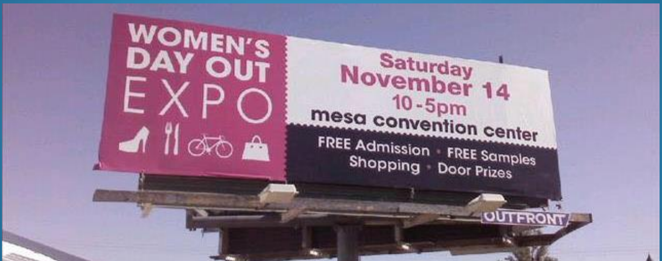
East Valley Outdoor Billboard