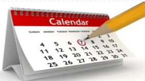
ON-LINE EVENT CALENDARS