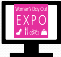
WEB SITE & DIGITAL MEDIA