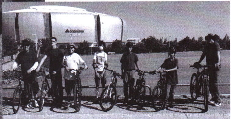
Troop 3 Bike Ride Sat Sept 11