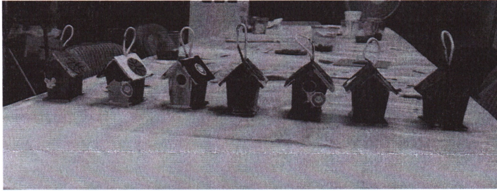
Birdhouses made by Lions and Tigers, Tues Sept 14