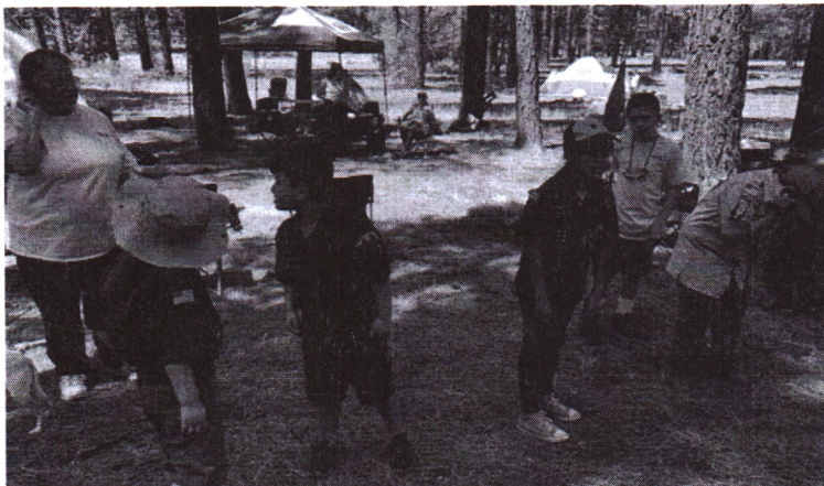
Cub Camping—looks like fun!