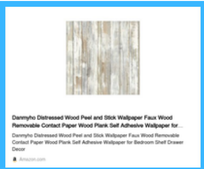
Removable Peel and Stick Wallpaper Accents