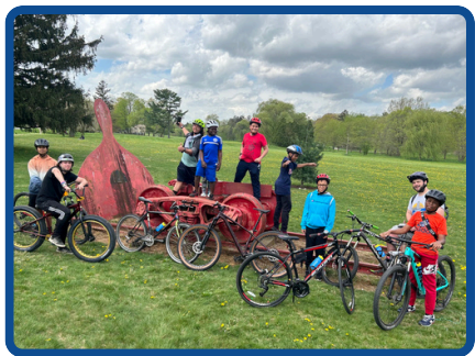
PRACTICE HABITS THAT SUPPORT PHYSICAL & MENTAL HEALTH