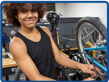
LEARN LIFE & STEAM SKILLS