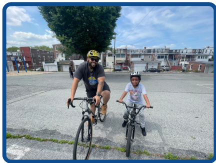
BUILD PROTECTIVE RELATIONSHIPS WITH MENTORS IN A SAFE SPACE