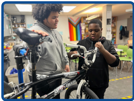
GROW AS ENGAGED CITIZENS & COMMUNITY LEADERS

Earn a Bike: In our flagship Earn a Bike program, students partner with adult mentors for month-long classes in mechanics and safety. While overhauling their bikes, students practice life skills by working collaboratively, solving problems, and learning perseverance. Classes are offered out of our Franklin Park, Keck Park, and West Ward bike shops, as well as in community schools across Allentown, Bethlehem, and Easton.