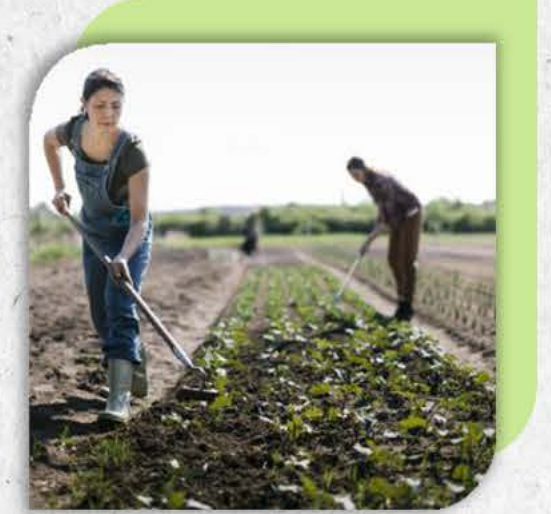
Climate resilience & soil quality