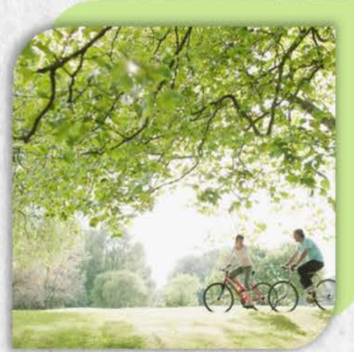
More green space