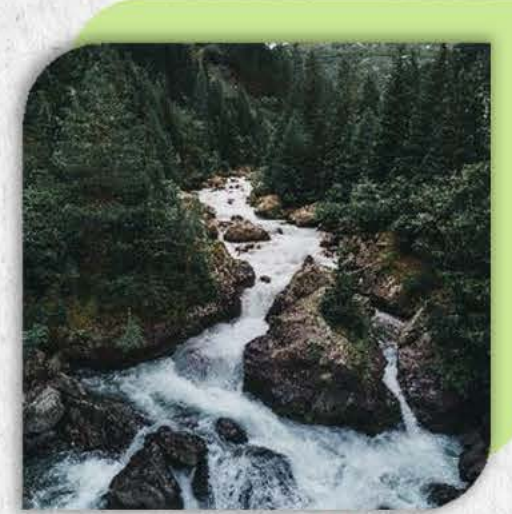
Improved water quality