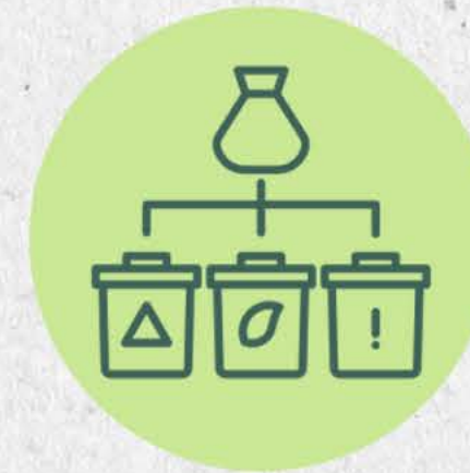
Waste & materials