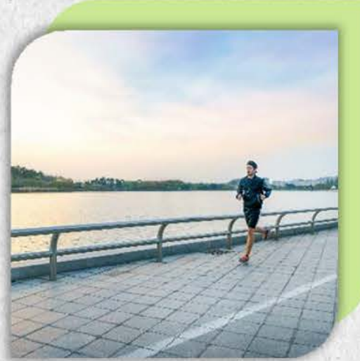
Improved public health