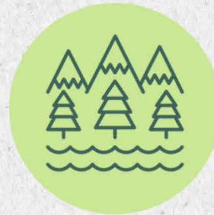
Natural & Working Lands